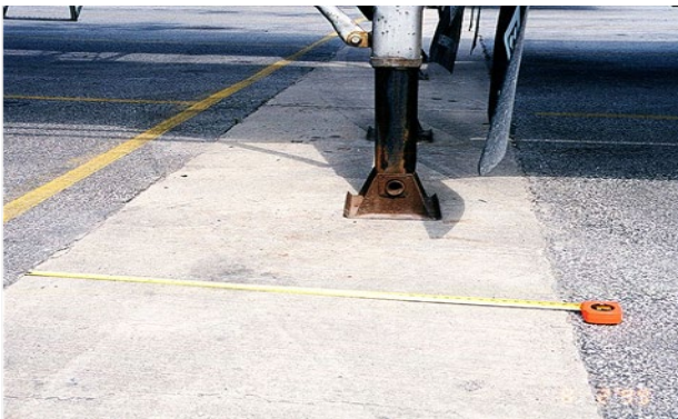
Figure 1: FRC bonded on asphalt.

Therefore, there is a need to (1) establish a systematic and functional process that can guarantee the success of the FRC overlay application, (2) develop performance criteria for acceptability, (3) establish defined protocols for agencies to be able to evaluate a product that is submitted for approval, and (4) identify methodologies that facilitate the decision-making process.