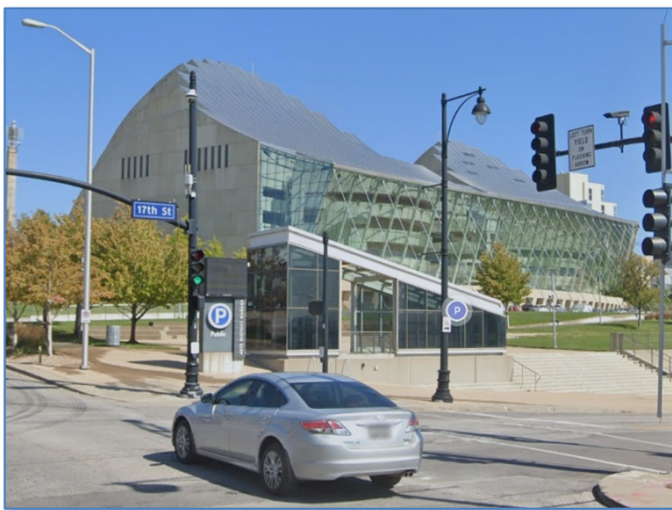
Figure 1. Flashing yellow arrow signal for permissive left-turn movement in an urban area.

Based on these results, FYA could be expected to produce a safety and economic benefit for left turn opposite direction crashes at locations where it is being used to replace circular green.