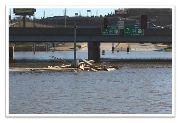
Meramec River flooding at I-44/Route 141

For more information, see the <u>FIM Program Fact</u> <u>Sheet</u>. In addition, a <u>FIM Toolbox</u> provides a set of criteria and guidance on how to develop a FIM in other parts of the country. There is also a more mobile friendly interface for the <u>FIM</u> <u>Mapper Tool</u> (Adobe Flash not required).